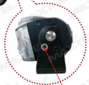
Fine Adjustment System